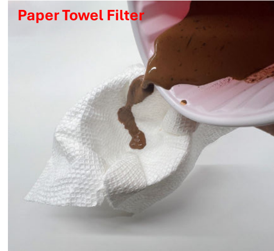
Paper Towel Filter

Once in place slowly pour the soil/water slurry into the filter