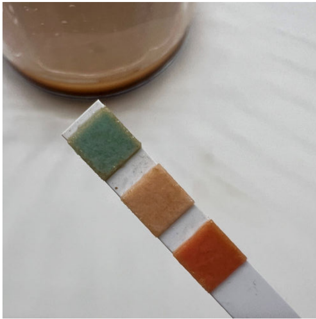
Filtered solution test