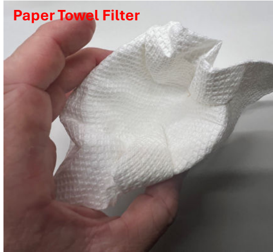
Paper Towel Filter

Tuck paper towel into cup to make a concave filter