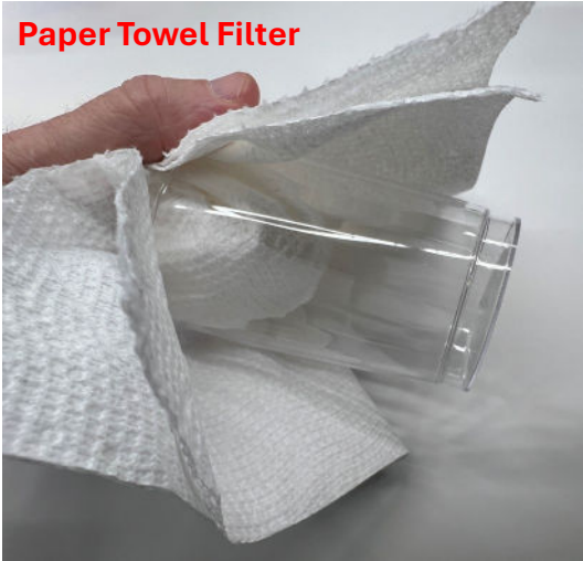
Paper Towel Filter

Use 2 sheets of paper towel and stuff into cup to make a simple filter